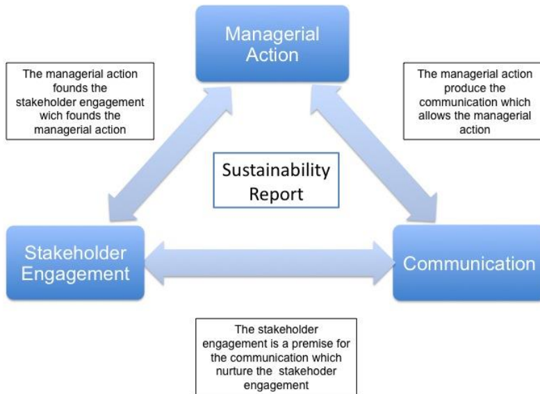
Figure 1. The relationships between managerial actions, communication processes and stakeholder engagement (Gazzola & Colombo, 2013)

Thus the sustainability report must be a valid instrument that stimulates and heightens the awareness of management in responsibly pursuing an effective social role to continually improve nonprofit organization performance (Manetti & Toccafondi, 2014). Drafting a sustainability report means joining the pursuit of the mission with the collective interest; it is an index of progress on the communications front as well. The sustainability report must express and harmoniously reconcile the economic measures and the quality of the relationship between the organization and its stakeholders, represented by the collectivity (Vlad, 2012).