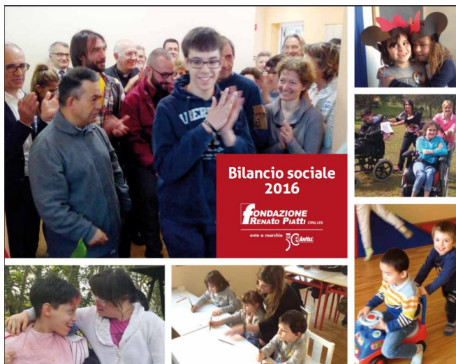
Figure 3. Cover of the Social Report 2016 Fondazione Renato Piatti Onlus

It is evident, therefore, that an organization of this size have the need and the requirement to have also a tool able to make more clear and transparent to its stakeholders that is able to do, every day, for people with intellectual and relational disabilities. Then, starting in 2008, the governing bodies of the Fondazione Piatti, have decided to take the experience of the construction of a Mission report for 2008, which is useful to start a growth path that would lead, in 2010, to develop the first document of sustainability reporting for 2009 (Figure 2); from then on, have been prepared the financial statements of the following years, introducing each time more information and making necessary changes, useful to achieve the goal of building a tool capable of reporting comprehensively on all activities of the organization and respond in full to the information needs of all stakeholders (Figure 3), Although it is not forced by law (in 2016 it had 335 employees and a total staff of 478 units).