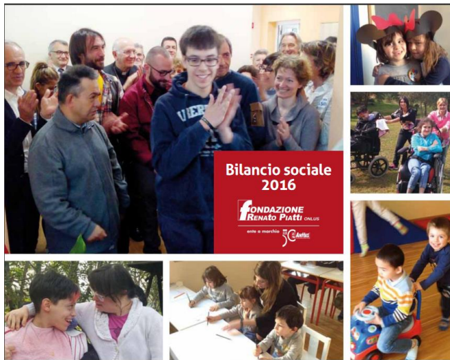
Figure 3. Cover of the Social Report 2016 Fondazione Renato Piatti Onlus

It is evident, therefore, that an organization of this size have the need and the requirement to have also a tool able to make more clear and transparent to its stakeholders that is able to do, every day, for people with intellectual and relational disabilities. Then, starting in 2008, the governing bodies of the Fondazione Piatti, have decided to take the experience of the construction of a Mission report for 2008, which is useful to start a growth path that would lead, in 2010, to develop the first document of sustainability reporting for 2009 (Figure 2); from then on, have been prepared the financial statements of the following years, introducing each time more information and making necessary changes, useful to achieve the goal of building a tool capable of reporting comprehensively on all activities of the organization and respond in full to the information needs of all stakeholders (Figure 3), Although it is not forced by law (in 2016 it had 335 employees and a total staff of 478 units).