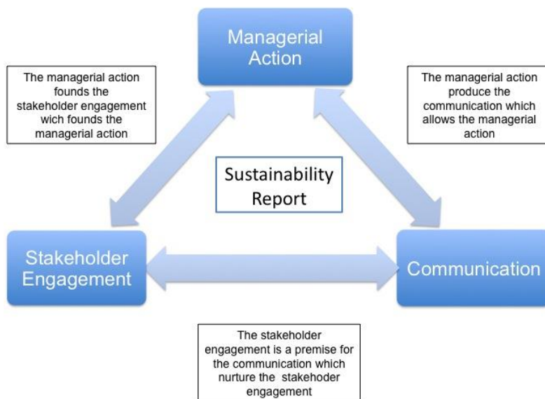
Figure 1. The relationships between managerial actions, communication processes and stakeholder engagement (Gazzola & Colombo, 2013)

Thus the sustainability report must be a valid instrument that stimulates and heightens the awareness of management in responsibly pursuing an effective social role to continually improve nonprofit organization performance (Manetti & Toccafondi, 2014). Drafting a sustainability report means joining the pursuit of the mission with the collective interest; it is an index of progress on the communications front as well. The sustainability report must express and harmoniously reconcile the economic measures and the quality of the relationship between the organization and its stakeholders, represented by the collectivity (Vlad, 2012).