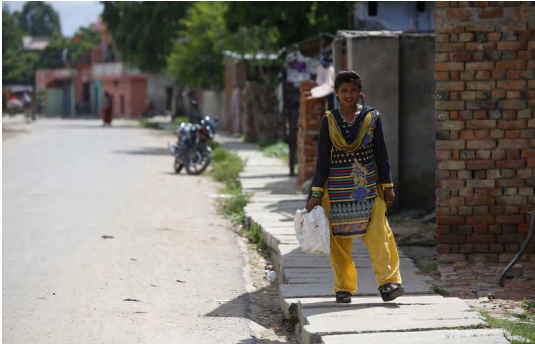
Improved roads bring multiple benefits. Better road conditions connect people to opportunities and services.

An important component of ADB assistance to urban development is the institutional strengthening of municipalities. ADB has helped improve urban management and resource mobilization, including the preparation of municipal action plans, training in revenue mobilization, better house tax and customer databases, and the introduction of computerized tax and service fee collection systems.