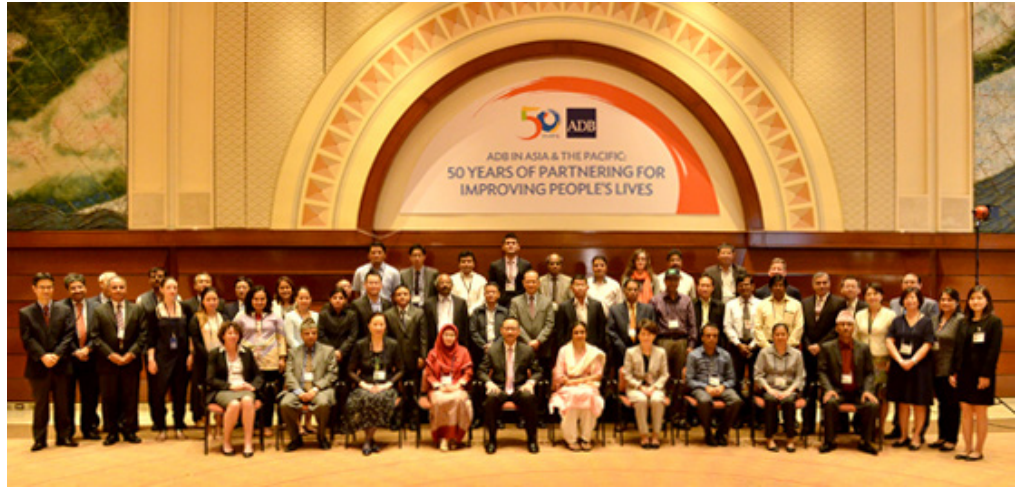
Sharing of smart solutions. The 2-day workshop on Knowledge-Intensive Agriculture gathered around 60 participants to discuss ongoing initiatives, current and emerging trends, policy imperatives, and future directions.

This report consolidates the key points and messages from the workshop sessions on various aspects of knowledge-intensive agriculture (see Appendix 1 for the workshop program). At the panel discussions, experts, policymakers, and private sector leaders discussed key issues, including the restructuring and transformation of labor-intensive agriculture to knowledge-intensive agriculture; integration of information and communication technology (ICT) into agricultural supply chains; use of high-level technologies in upstream and downstream agricultural activities; addressing infrastructure gaps, the digital divide, and lack of knowledge, skill, and education of the farming communities; and the importance of partnerships and mainstreaming of the use of knowledge in the agricultural sector. This report distills and sums up these discussions to share with a broader audience.