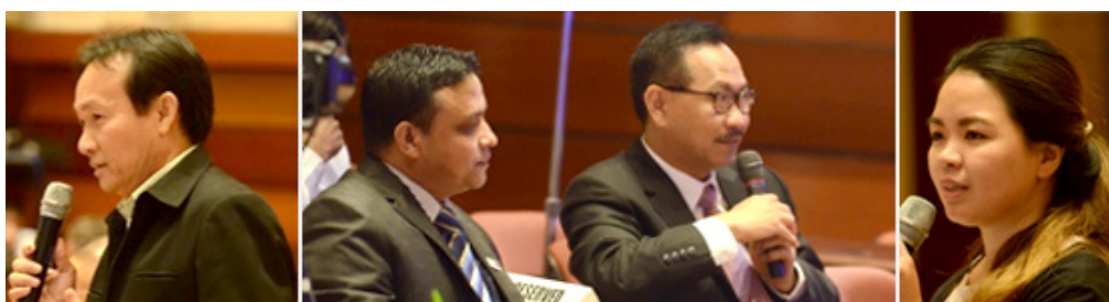
A venue for knowledge sharing. Participants and speakers exchange ideas and insights during the open forum (photo by Al Benavente).

Knowledge-intensive agriculture need not follow the same pathway as traditional agriculture. The path of knowledge-intensive agriculture includes greater reliance on outsourcing, thereby mitigating some of the expertise demands on smallholders and the possibility that various ICT innovations (such as online platforms) can actually broaden the spread of benefits from knowledge intensification. The session was wrapped up by noting the importance of socioeconomic implications of knowledge-based solutions, as well as the need for a diversity of solutions to some of the concerns raised.