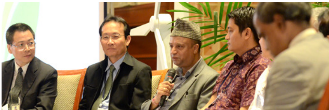
Learning from others. Panelists share their respective experiences in promoting knowledge-intensive agriculture.

The slow implementation pace coupled with the lack of ability to disburse funds in a timely manner was identified as a major challenge in many developing countries like Nepal. At the same time, it was argued that high subsidy is not required to promote financially viable agriculture based on knowledge and technology.