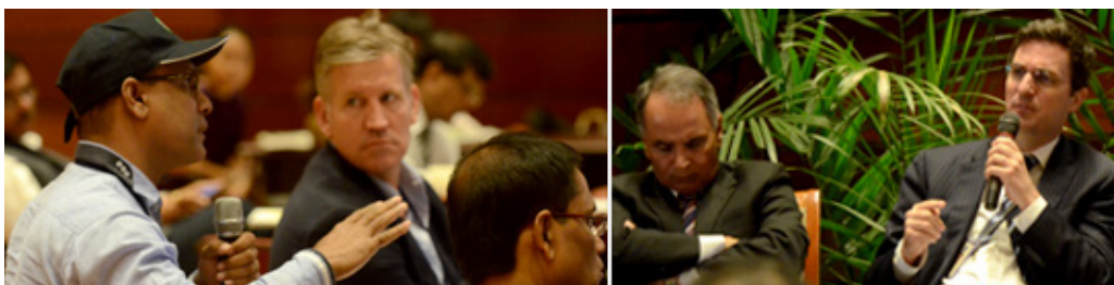
Collaboration is key. Participants raise questions and issues on the PPP modality, particularly how it can help modernize the agriculture sector (photo by AI Benavente).

At the same time, the importance of humanizing the private sector engagement has also been flagged by more than one participant. For instance, the private sector may seek to promote agrichemicals in its farmer extensions, whereas environmental goals may be high priority in government-led extensions.