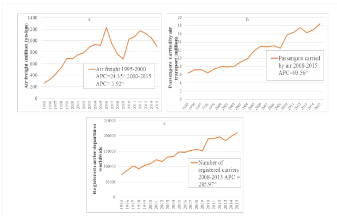
Figure 1. Time trends for air transport indicators between 1995 and 2015

^ Indicates APC is significantly different from zero at 95% confidence interval. APC = Annual Percentage Change