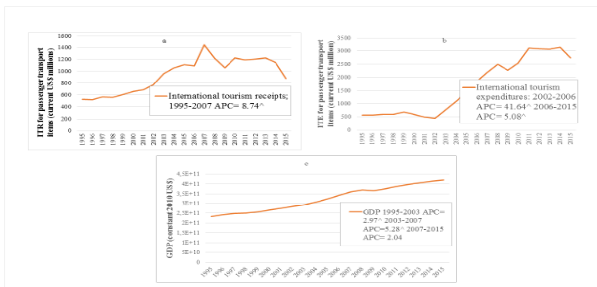
Figure 2. Time trends for tourism indicators and GDP between 1995 and 2015

Overtime trends for tourism indicators and GDP between 1995 and 2015 are presented in Figure 2. Significant increases were observed in international tourism expenditures (ITE) between 2002 and 2006 (APC; 41.64% p=0.01) and between 2006 and 2015 (APC; 5.08% p=0.01). International tourism receipts (ITR) increased with an APC of 8.74% (p=0.01) between 1995 and 2007 although a fluctuating trend was observed thereafter. For GDP an overall significant increase is observed between 1995 and 2015.