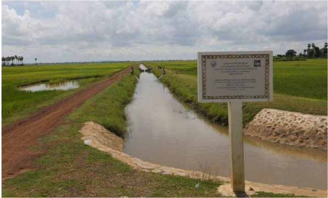
Improved agricultural yields. Upgrading the Boeng Khang Tbound Secondary Canal of the Tonle Sap Lowlands Rural Development Project has improved agricultural yields.

Since 2013, however, the productivity of paddy cultivation has more than doubled, yielding 875 tons of rice per season. Despite working in the wet-rice fields on a hot and sunny day, farmers rejoice in their daily toil, knowing that the first rice harvest has ended and the rainy season is approaching, which signals the start of Cambodia's main rice-planting season.