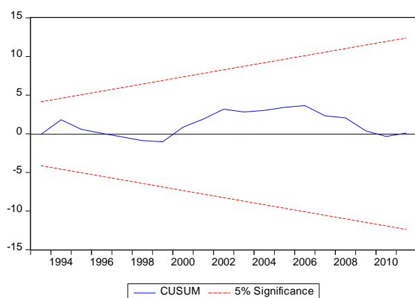
Figure 2. CUSUM statistics stability test