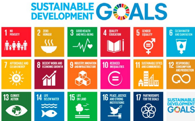
Figure 1 Sustainable Development Goals

The UNSDGs have been summarised by the UN as follows: