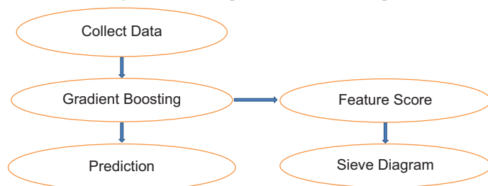
Figure 1: A description of the work's steps