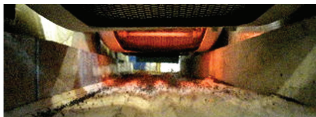
Fig. 1. Working chamber of the conveyor infrared dryer

One of the disadvantages of infrared drying is that the moisture inside is stored for a long time, and heat absorption occurs due to the outer surface of the grain. The proposed design (Fig. 1) makes it possible to minimize this shortcoming due to the uniform irradiation of the grain surface on both sides simultaneously. The developed vibrating conveyor dryer with bilateral infrared irradiation of products is a combination of an IR dryer with a vibrating tray conveyor with a combined kinematic method of oscillation generation.