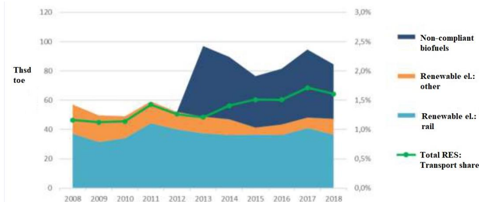
Figure 3. Consumption of energy from renewable sources in Ukraine's transport sector before 2019

But so called renewable electricity in railways, road transport (electric vehicles) and other forms of transport is included in the above category. Research [28] indicates that Ukraine could achieve even 13.8% of energy from RES in the transport sector in 2030, with the following contribution of the energy carriers: