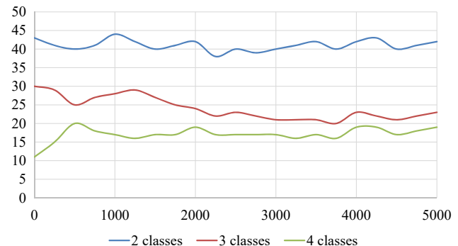
Fig. 2. Dependency of the accuracy of data classification depending on the amount of data and the number of categories using the Bloom filter