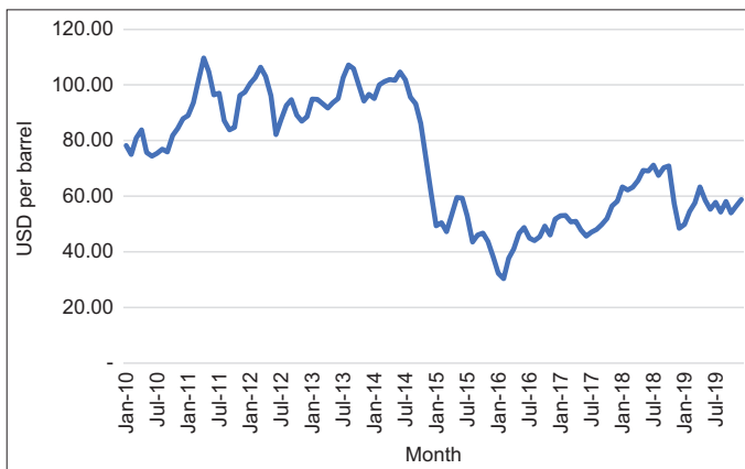
Figure 3: WTI crude oil price chart for 2010-2019