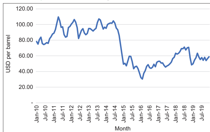
Figure 3: WTI crude oil price chart for 2010-2019