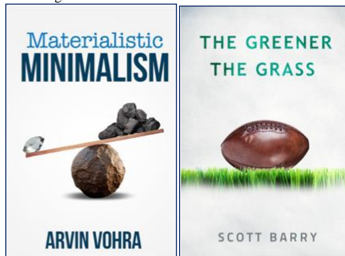
Figure 4. Minimalistic cover design for single titles: Vohra, 2017 and Barry, 2017

C.H. Beck Wissen furthermore alleviate the fear that a minimalist cover might leave no room for creativity. More than 500 different covers published C.H. Beck Wissen shows the wide range of unique cover layout alternatives even within this tight requirement on series design. But not only series, also single titles work well with minimalism as Figure 4 shows: