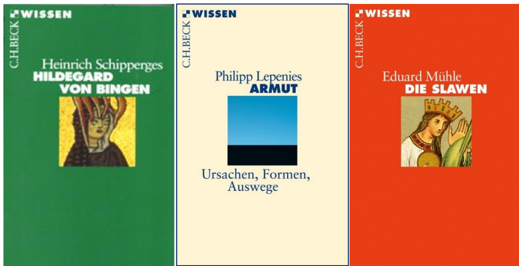
Figure 3. Cover Design of C.H. Beck series: Schipperges 2005, Lepenies 2017 and Mühle 2017.

Each of the cover elements has a meaning and is well elaborated: The chessboard element in the series name stands for wisdom, the author and title are always positioned at the same place in order to build habits with the consumers which help them to capture the topic even faster and the title is always written in upper-case letters and in bold font in order to emphasise the importance of topic before author (Gießler 2006, pp. 146-147).