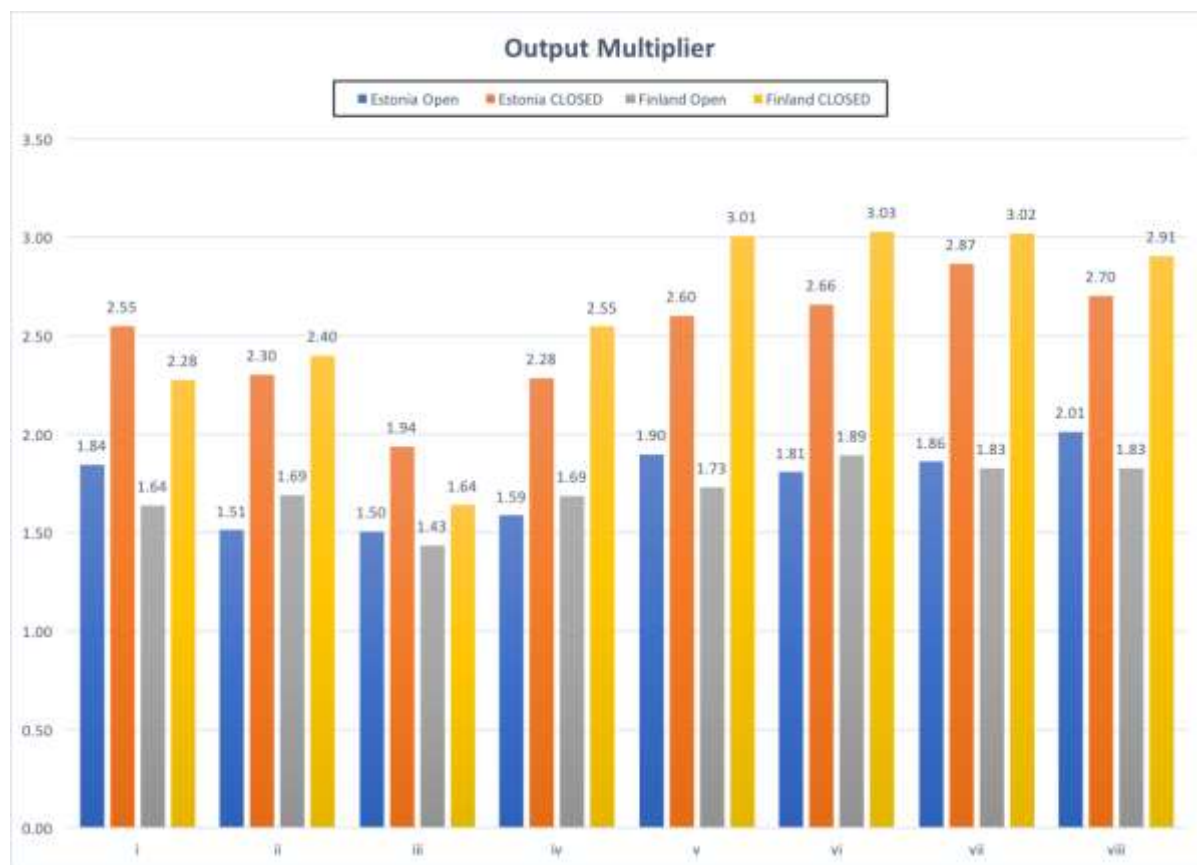
Figure 4.1. Output Multipliers for the economies of Estonia and Finland, 2011

Note: Sectors: (i) Agriculture, hunting, forestry and fishing; (ii) Mining and quarrying; (iii) Coke, refined petroleum products and nuclear fuel; (iv) Motor vehicles, trailers and semi-trailers; (v) Other transport equipment; (vi) Construction; (vii) Hotels and restaurants; (viii) Transport and storage.