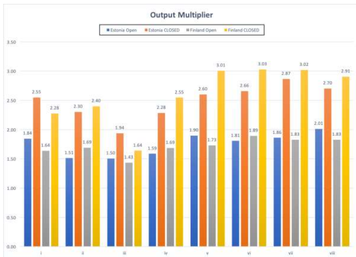
Figure 4.1. Output Multipliers for the economies of Estonia and Finland, 2011

Note: Sectors: (i) Agriculture, hunting, forestry and fishing; (ii) Mining and quarrying; (iii) Coke, refined petroleum products and nuclear fuel; (iv) Motor vehicles, trailers and semi-trailers; (v) Other transport equipment; (vi) Construction; (vii) Hotels and restaurants; (viii) Transport and storage.