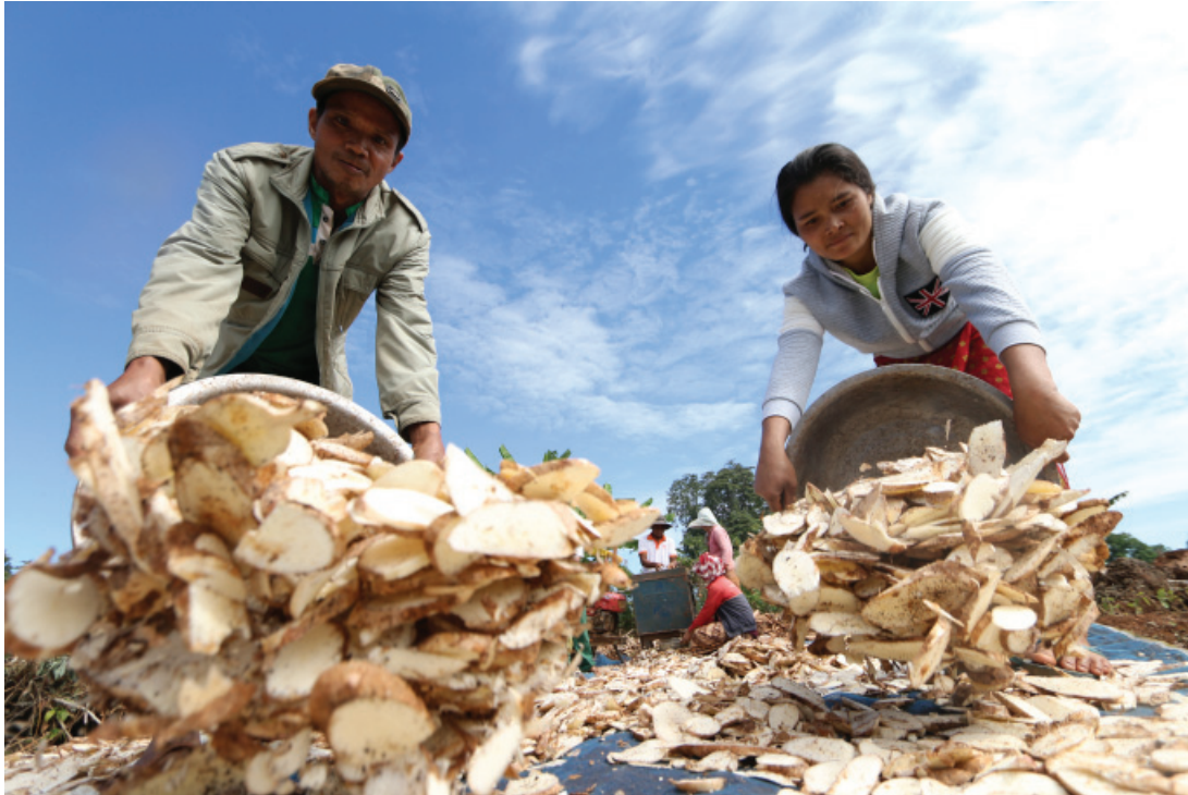
Farmer beneficiaries of the Sustainable Natural Resource Management and Productivity Enhancement Project with freshly harvested and chopped cassava.