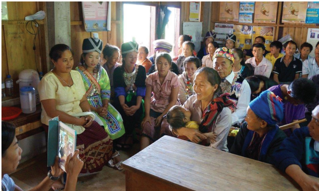
Members of an ethnic group gather in Phapheung village in Khoun District, Xiengkhouang Province attend a learning and activities event provided under the JFPR-financed Developing Model Healthy Villages in Northern Lao PDR Project.

The Health Sector Governance Program—ADB's first program-based assistance for the sector—achieved the bulk of its performance targets to improve health planning and budgeting; increase access to maternal, newborn, and child health care; and strengthen human resources.