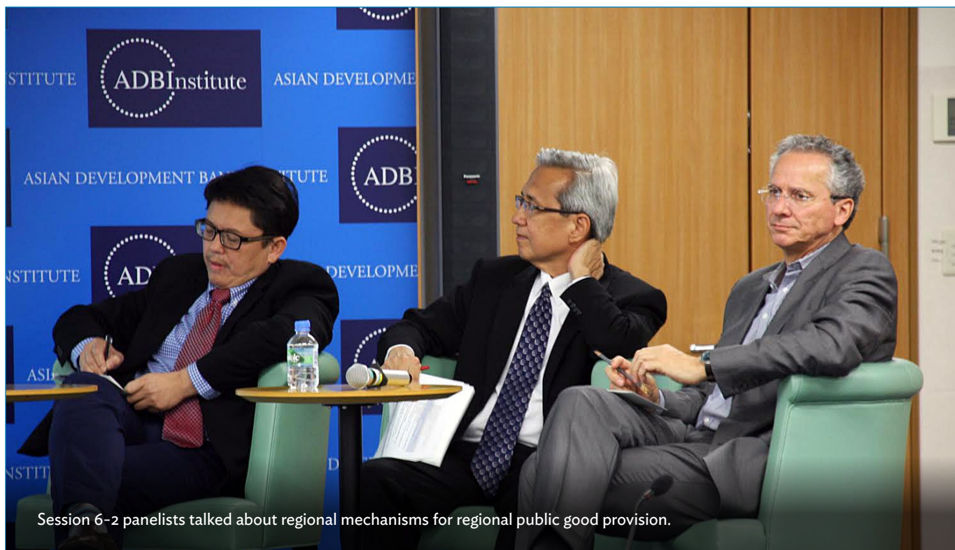
Session 6-2 panelists talked about regional mechanisms for regional public good provision.

the focus of the Montreal Protocol from the very beginning. An important element of the agreement was the ban on trade in the chlorofluorocarbons and products containing them. The design or mechanism of the agreement totally transformed the game by reducing the benefits from free-riding.