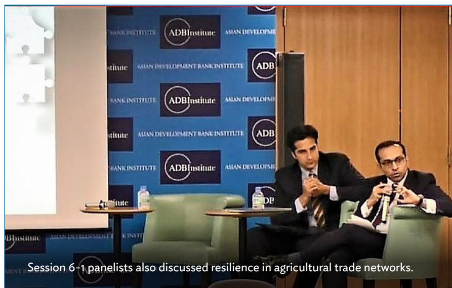
Session 6-1 panelists also discussed resilience in agricultural trade networks.

break in the supply chain. Another commenter noted that making the distinction between centralized and decentralized networks could be a better approach to tackling a tradeoff between efficiency (implying specialization and centralization) and redundancy of supply—i.e., efficient networks are less resilient. On the proper approach to promote trade resilience, Mr. Jacob noted that changing the trade structure and addressing risks to supply, such as by climate-proofing production facilities, are both relevant. The analysis could also be expanded to include industries such as manufacturing and services.