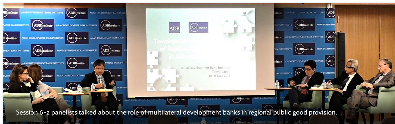
Session 6–2 panelists talked about the role of multilateral development banks in regional public good provision.