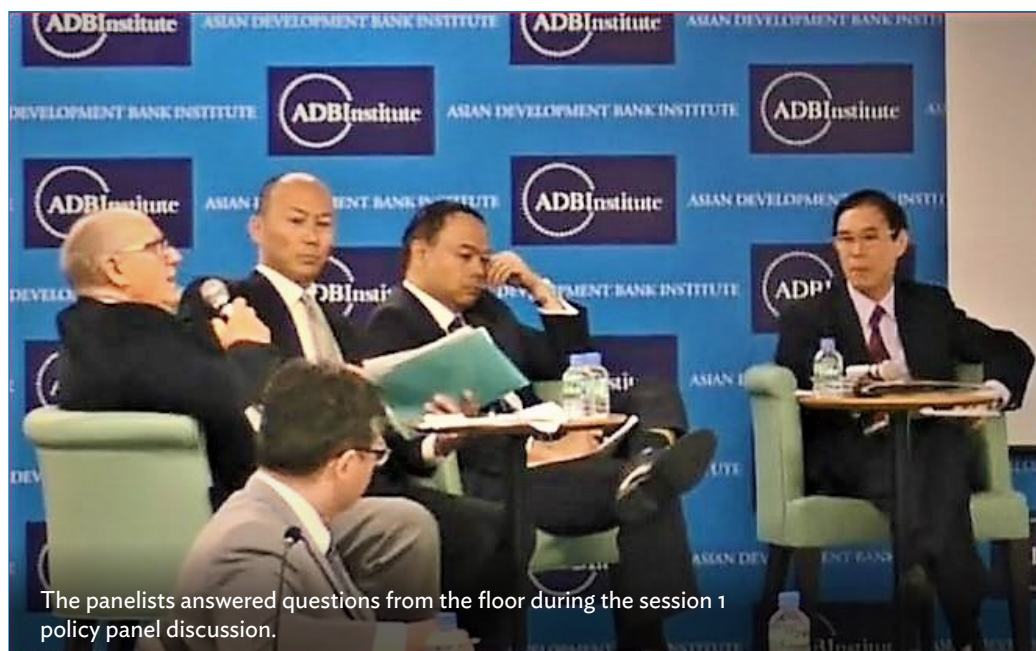
The panelists answered questions from the floor during the session 1 policy panel discussion.

A comment from the audience turned to the role of the market or private sector. This pointed out several instances where public goods are provided by the private sector. As such, the role of the private sector in mobilizing private funding should be considered and defined, not least because the region is facing huge infrastructure needs that the public sector alone cannot finance.