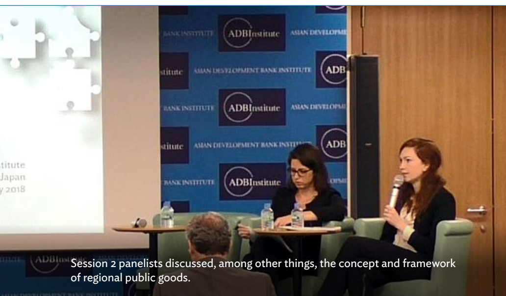
Session 2 panelists discussed, among other things, the concept and framework of regional public goods.

multilateral banks is intensified and cooperation with political partners is strengthened.