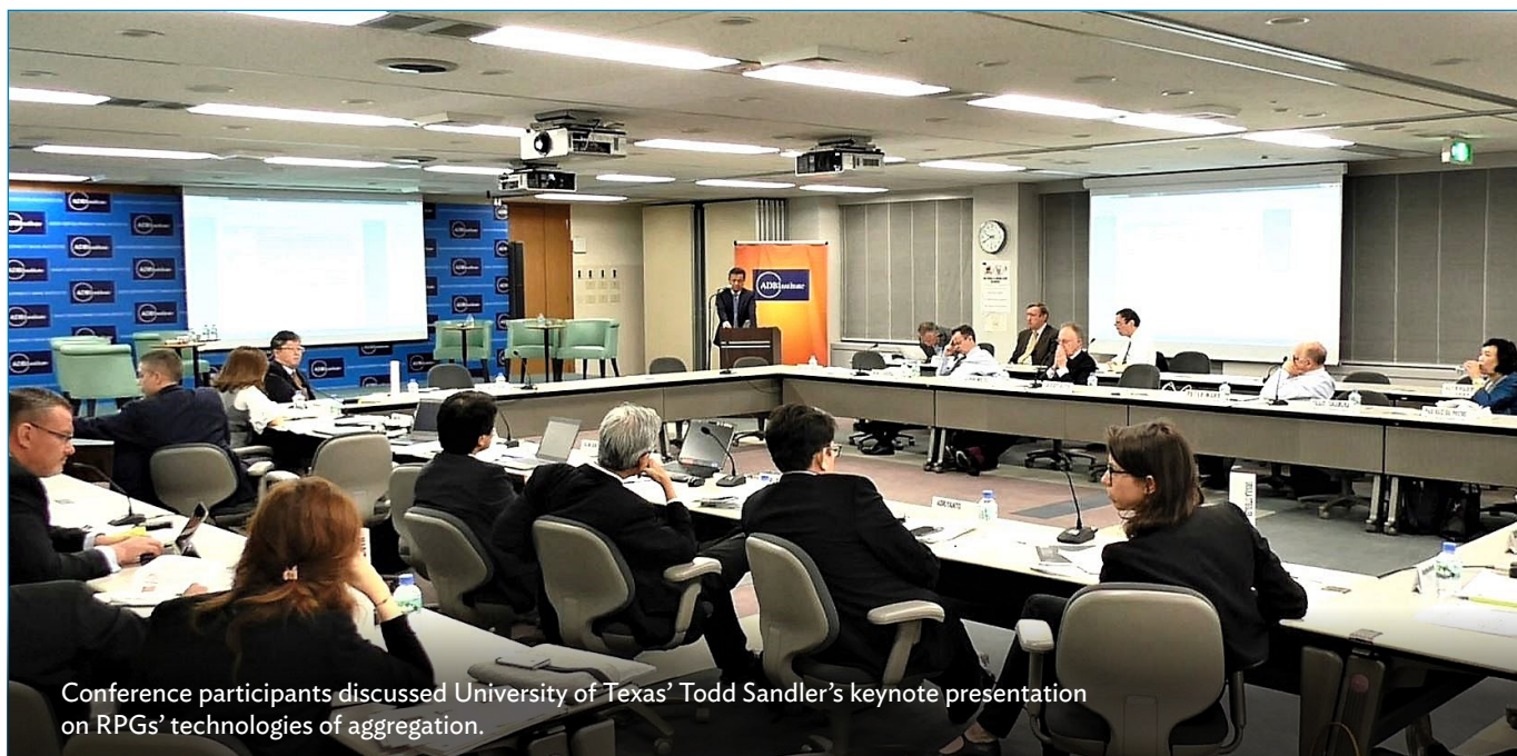
Conference participants discussed University of Texas' Todd Sandler's keynote presentation on RPGs' technologies of aggregation.

Multilateral institutions can primarily help in transregional public goods and global public goods, but they can also aid in regional public goods.