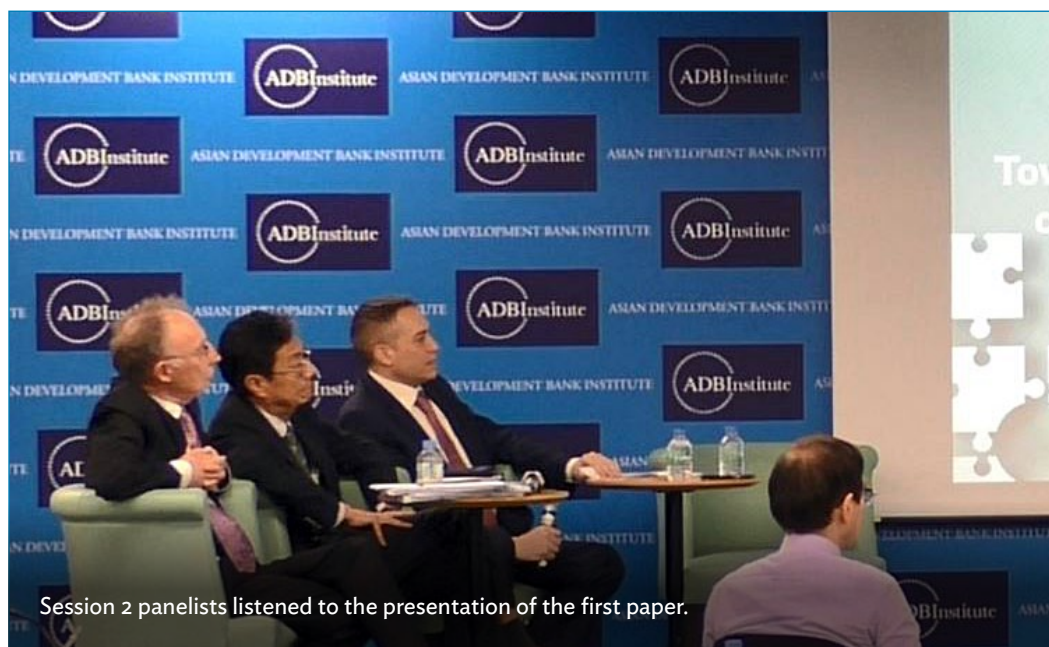
Session 2 panelists listened to the presentation of the first paper.

RPGs are essential to attaining the 2030 Agenda for Sustainable Development. Analyzing the link established between the agenda and RPGs, the authors found that even though RPGs and global public goods are not explicitly mentioned in the 2030 Agenda, RPGs are an integral part of all 17 Sustainable Development Goals (SDGs). The opportunity for RPGs with multiple functions to bring many different benefits is relevant for multilateral development banks looking to optimize the provision of RPGs in achieving the SDGs. In addition, while most SDG targets require policy action for RPG provision (of the 169 targets, 101 that are RPG-relevant were identified), opportunities exist for market-based solutions.