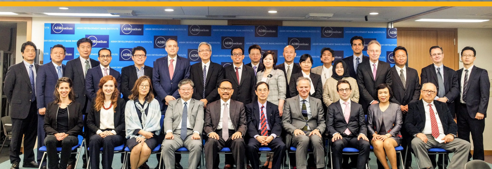
Conference participants gathered together after the opening session.