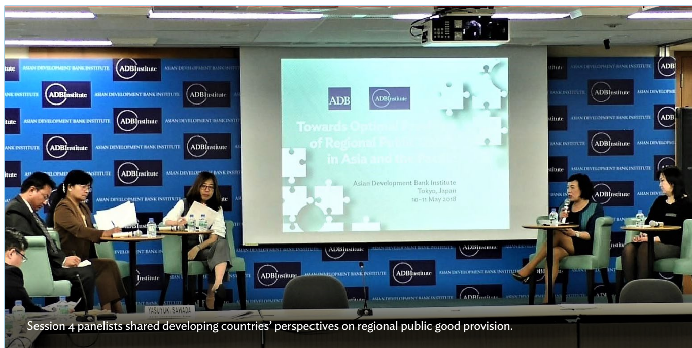
Session 4 panelists shared developing countries' perspectives on regional public good provision.

banks is necessary for developing economies given the shortage in such countries of financial resources and capacity to meet the huge demands of RPGs, said the panelist.