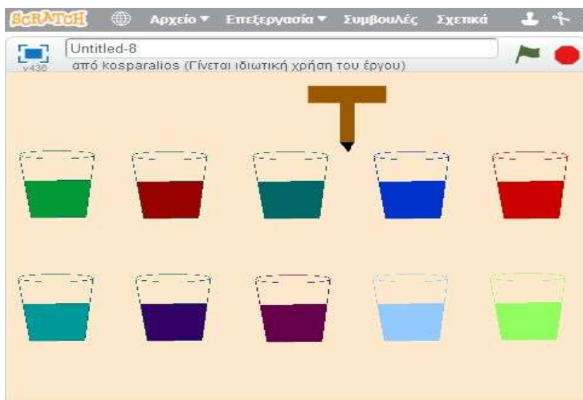
Figure 3: Scratch software to measure the pH of the substance contained in the glasses, Assessment Activity