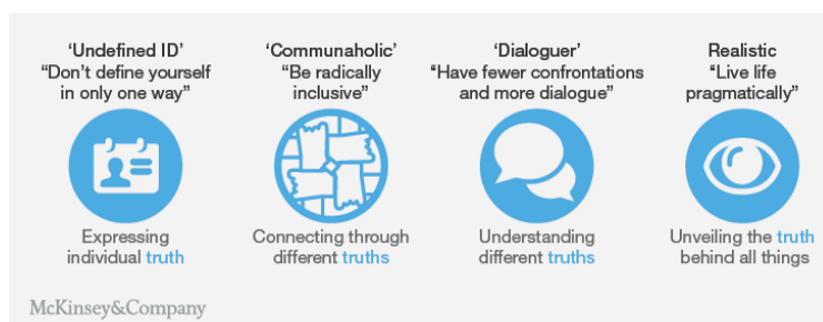
Figure 2. Generation Z characteristics (Francis & Hoefel, 2018)

A McKinsey & Company report highlights four fundamental Gen Z behaviors, all based on a single element– this generation continuous search for truth (Francis & Hoefel, 2018). These four behaviors, as seen in figure 2, refer to (1) individual expression highly valued by members of Gen Z; (2) Inclusivity and self-centeredness, as shown in another study (E&Y, 2015), that correlates with the findings of Francis & Hoefel (2018). This means that the younger people place a greater emphasis on their role in the world as part of a larger ecosystem and their responsibility to help improve it (E&Y, 2015), as they mobilize themselves for a variety of causes (Francis & Hoefel, 2018). (3) Finally, their decision-making process is highly analytical and pragmatic (Francis & Hoefel, 2018).