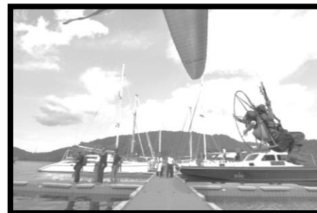
Pic 2: Marina Lhok Weng, Sabang

Yet from a geographical point of view, Sabang is very close to Phuket and Langkawi. The two main areas of sailing ship destination in the region. The distance from Sabang to Phuket is only 220 NM. While the distance of Sabang to Langkawi is only 260 NM. When the average speed of sailing vessels 10 NM per hour, then Sabang can be reached by the sailboats from Phuket just only 22 hours. But why is the number of sailboats coming to Sabang not as been expected? This paper aims to examine more deeply, why the visit of the sailing ship to Sabang is still relatively small, whereas the infrastructure built, promotion activities, as well as the geographical factor of Sabang, actually become strength factors to attract more sailors to visit Sabang.