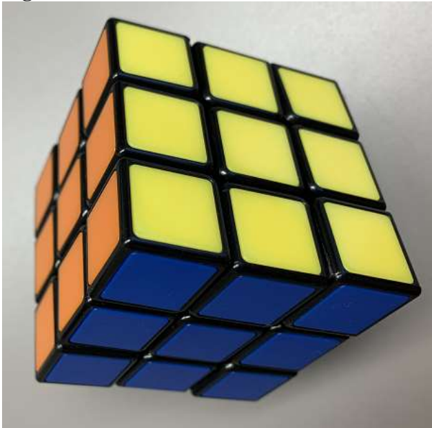
Figure 2. Theoretical Ethical Cube

In this theoretical state, each face displays solely its own attributes (imagine one color per face as in Figure 2). Nevertheless, as soon as ethical dilemmas surface, the cube becomes ruffled. In this condition, attributes of diverse faces are assorted irregularly, such that the faces lost their homogeneity. In this way, attributes of a particular set of ethical values (let's say professional ethics) are replaced by other traits that don't belong to it (Figure 3). It can be said that the shuffling process is stimulated by the SSA and the LoI (Lopez and Medina 2016).