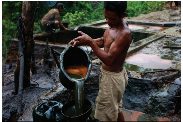
Figure 1: Crude oil from marginal wells in Indonesia

utilizes Lagrange multiplier (LM) test, homoscedastic test utilizes ARCH test, and normality test utilizes Jarque Berra test.