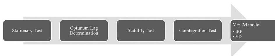
Figure 2: Analysis procedure

There is a connection between the two directions between CO 2 and the growth economy, meaning that CO 2 affects the growth economy also; otherwise, the growth economy is influenced by CO 2 (Arista and Amar, 2019). Research by Acheampong (2018) finds that CO 2 positively causes growth economy. CO 2 increase can increase the growth economy because Keep will increase energy consumption followed by enhanced motorized vehicle use