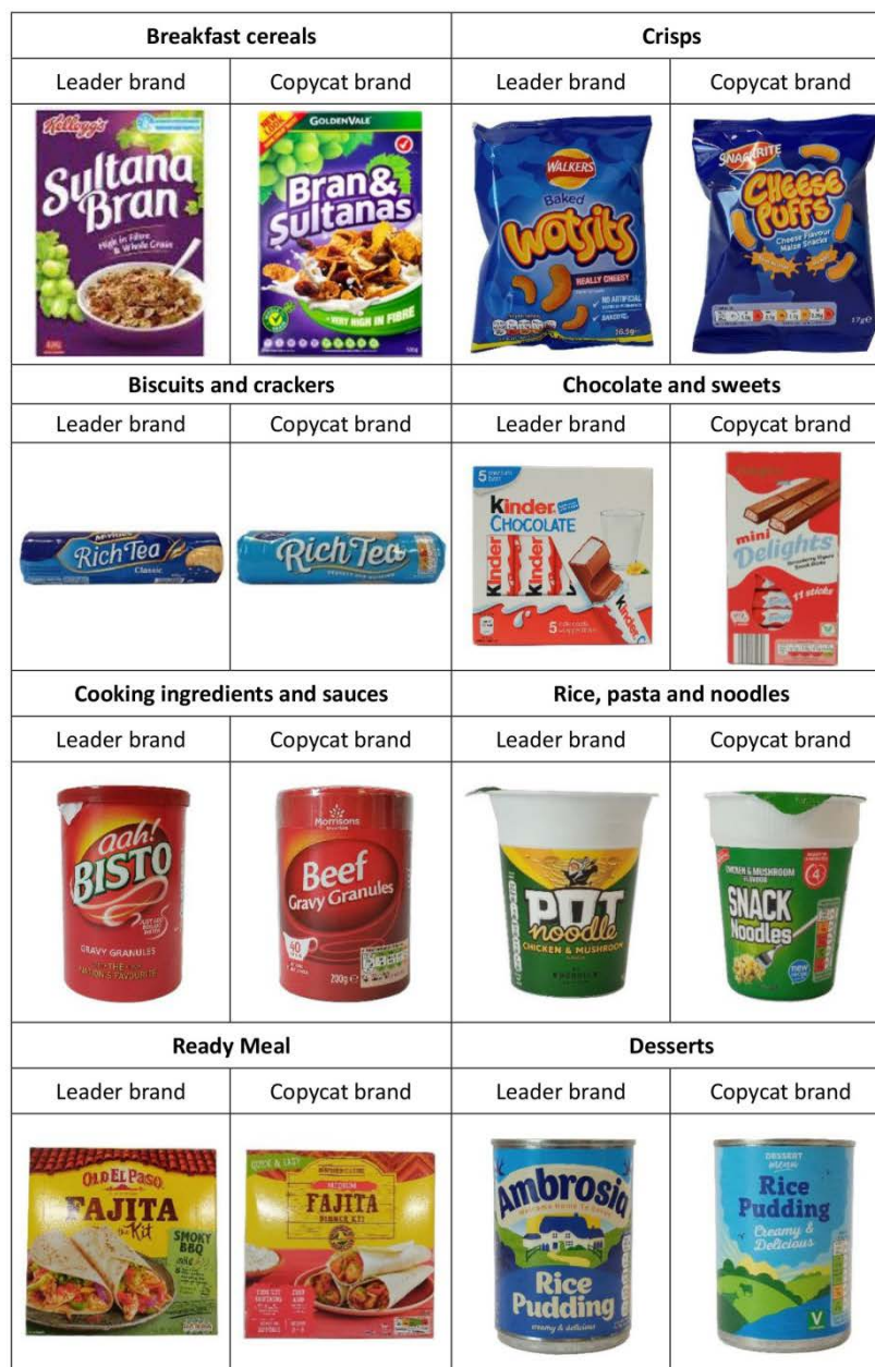
Figure 3. Pair-Packaged Examples from Different Product Categories