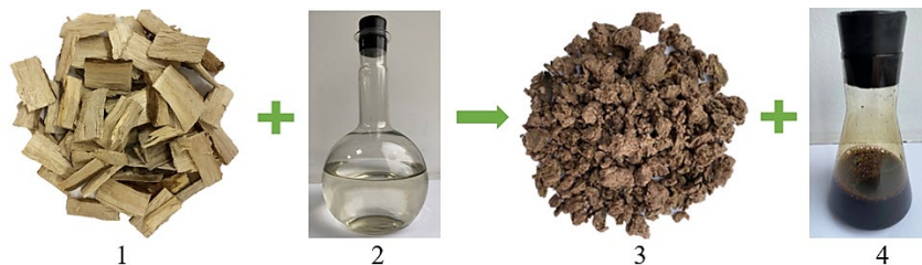
Fig. 1. The general scheme for obtaining fibrous semi-finished products and black liquor: 1 – wood chips; 2 – sodium chloride; 3 – washed fibrous semi-finished product after cooking; 4 – black liquor

The yield of the semi-finished product [15] and the mass fraction of lignin [16] were determined in the solid residue. The content of dry substances [17] and their ash content [18] were determined in black liquor. The total titrated and active alkalinity was determined in the original and used solution according to the standard method [18]. The pH of the solution was also measured using a pH-150MI pH meter and litmus paper. The result was taken as the average arithmetic value of three parallel measurements.