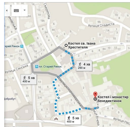
Fig. 3. Choosing a possible option for building a tour route between points x_1 and x_2

Thus, the attractiveness score of this route for the user is 280 points. This allows to compare different routes and determine which one may be more attractive to a given user, taking into account their preferences and other criteria (Fig. 3).