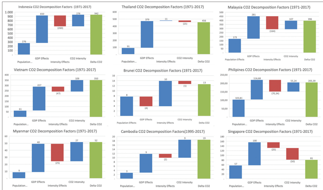
Figure 1: Individual country analysis on delta CO 2

of carbon emissions in the Philippines were changes in carbon intensity, economic development, and population expansion. Delta CO 2 in Singapore significantly rose. GDP and intensity impacts both had a substantial impact, with the latter showing an increase in energy efficiency while the former increased emissions. Delta CO 2 levels in Thailand increased significantly, with GDP impacts being the main driver. Population impacts also contributed, underscoring that Thailand's fast economic expansion was the country's primary source of carbon emissions. Delta CO 2 in Vietnam substantially increased. Population effects and CO 2 intensity had a considerable impact, indicating that both population expansion and variations in carbon intensity considerably impacted Vietnam's carbon emissions.