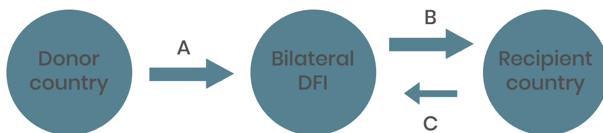
Figure 2 – Accounting for bilateral instruments for the private sector