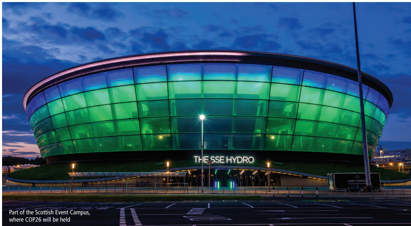
Part of the Scottish Event Campus, where COP26 will be held