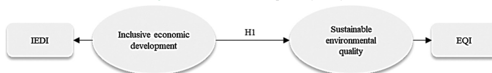
Figure 2: Research model pathway analysis

Sustainable environmental quality represented by the Environmental quality index (EQI); Inclusive economic development represented by the inclusive economic development index (IEDI)