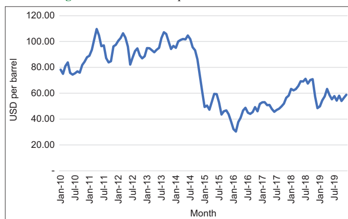
Figure 3: WTI crude oil price chart for 2010-2019