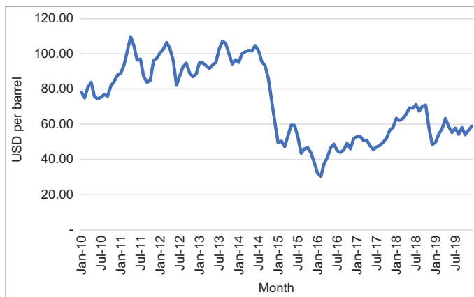
Figure 3: WTI crude oil price chart for 2010-2019