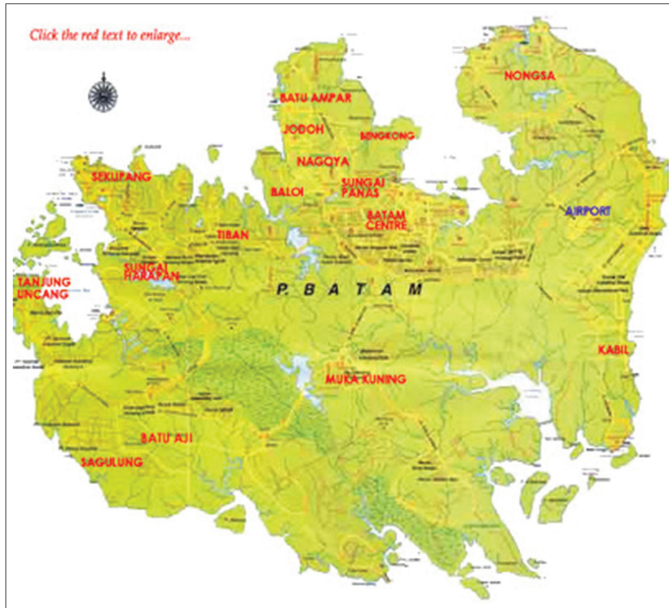
Figure 2: Map of Batam Island

relationship model between ecological aspects, economic aspects and social aspects and the implementation of EMS shows fit with actual data. This means that overall the relationship model built in this study is fit with the actual data on the research object. After knowing the conceptual model used in this study is fit with the actual data, then further testing of the hypothesis proposed in this study.