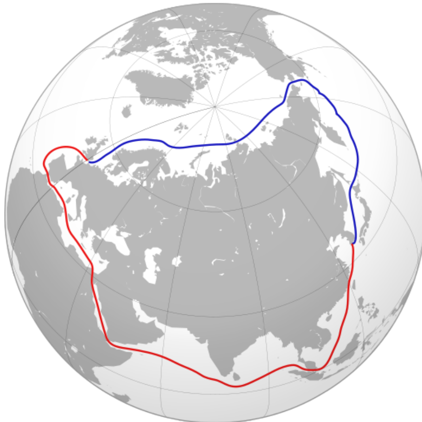
Figure 1 A graphical comparison between the Northeast Passage and the southern route

The Northeast Passage in blue The southern route in red