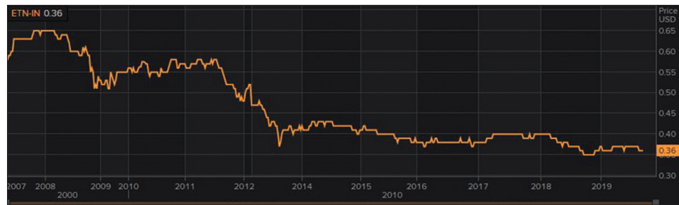
Figure 1: Indian bioethanol price