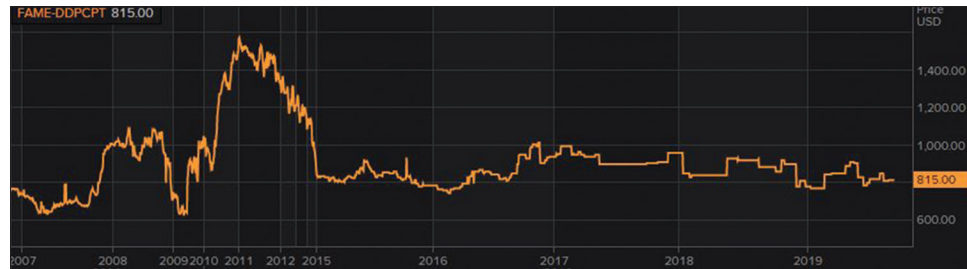
Figure 2: Fatty acid methyl ester biodiesel price