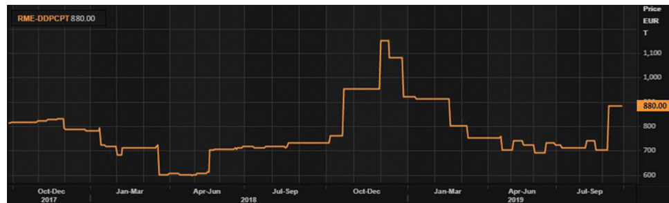
Figure 3: Rapeseed oil methyl ester biodiesel price