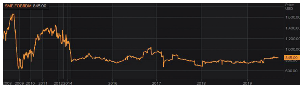
Figure 4: Soybean methyl ester biodiesel price